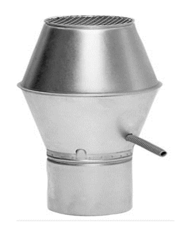
IIAR-2 Recommend ventilation discharge upwards with a velocity of > 12.7m/s